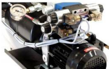
HYDRAULIC PUMP SYSTEM