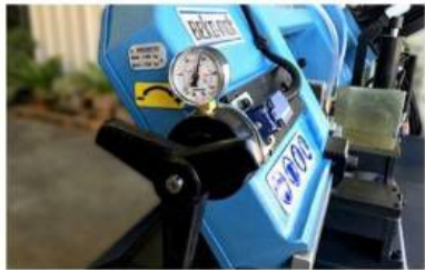
HYDROMECHANICAL BLADE TENSION